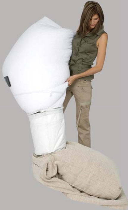
F I L L