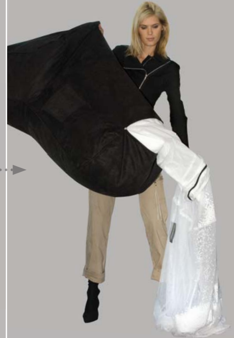
C L E A N

Transfer bean bag sofa filling freely and easily. No more spilling the beans.