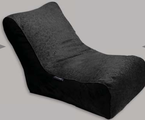
L O U N G E